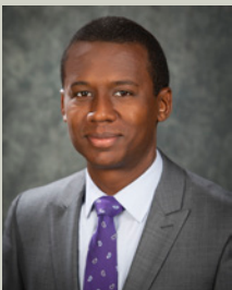
Jerry L. Demings Orange County Mayor